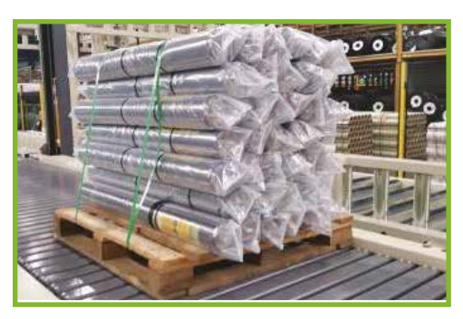
Cutting - Folding - Inspecting - Welding (Un)rolling - Packing - Stacking - Transport